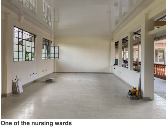
One of the nursing wards